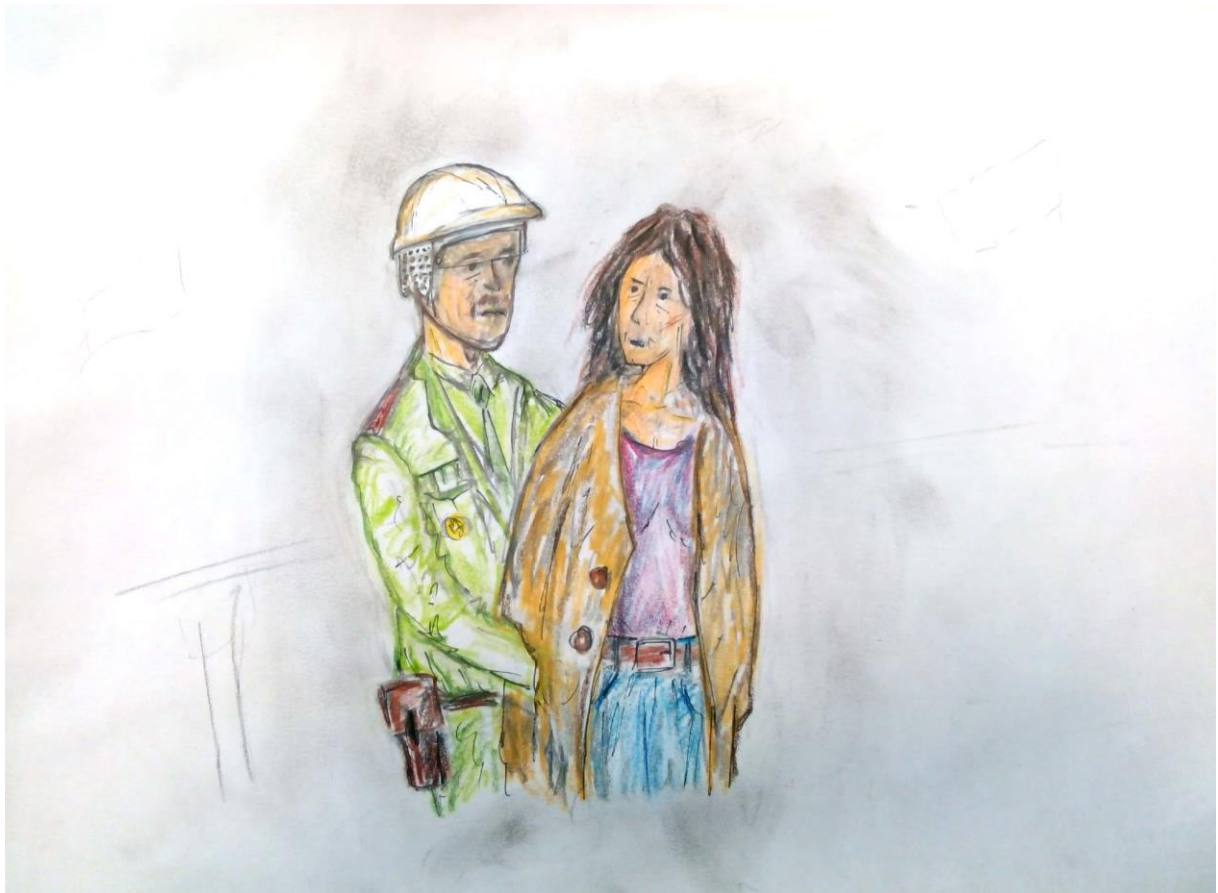
2x ilustrace Martin Čermák